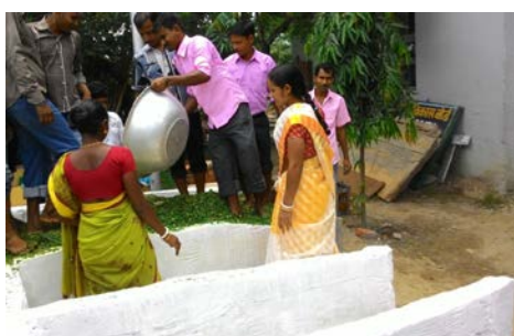
Figure 1: Loading of chaffed green fodder in to the Silo Pit by women trainees