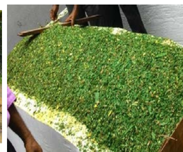
Figure 3 Finishing from Top for further wrapping by polythene sheet