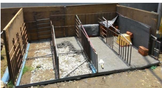
Figure 2 filling by necessary RCC materials

The iron scraps were integrated by welding together and erected as a composite structure by a fabricator as per our own design and dimension - 2.5 ft width, 6 ft length and 3 ft height for each chamber. Then the structure was filled up by a mixture of cement, concrete and sand with desired proportions to shape it to look like a mini Silopit. The whole process was monitored by us and works went on till the Pits look like a Silo Pit. The exact cost of the Silopits which can accommodate around 20 quintals of fodder in all four chambers is elucidated in the following table.