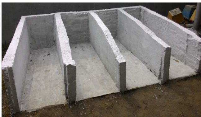
Figure 4 Tetra Silo Pits are now reday for filling

The Silage Chambers now ready for use after the mason and fabrication works