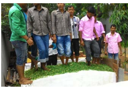
Figure 2: Pressing manually to make the environment anaerobic