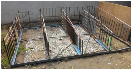
Figure 1 Fabrication work is completed

We, here at RDTC, Siliguri developed the multiple surface Silopits by using iron scraps lying at our campus and erected the Twin Silo pits with four different chambers. The cost of the iron scraps is just negligible compared to the purpose it has fulfilled to convert the facility into an asset. What