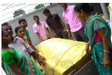
Figure 4: Wrapping by a sheet of polythene