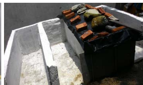
Figure 6 Final Finishing of the Silo pit to protect against rain and water , wrapping by a polythene sheet and loading it again by Stones/Bricks