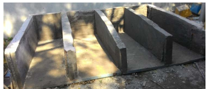
Figure 3 Silos now ready after being filled up required materials

The Silo pits were found to be quite strong and able to bear the