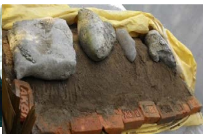
Figure 5 Loading a layer of Soil to keep the top surface anaerobic followed by further pressure by Stone Pieces