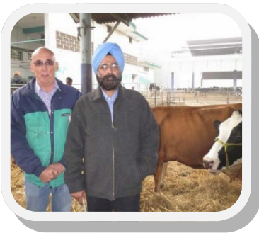
Dairy farm North of Delhi

CVS recently led a team of Australian and Indian dairy experts to develop strategies and projects that will assist the development of the Indian commercial Dairy Industry, and highlight how Australia can assist.