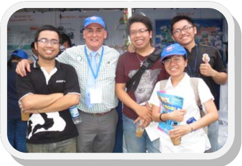
Celebrating with final year students

A second shipment of donated veterinary books is also now being shipped, with the support of Samford Rotary Club.