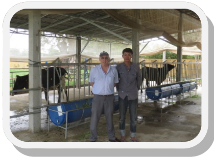
New dairy at Royal University of Agriculture Phnom Penh, Cambodia

CVS was part of an Australian academic group that redeveloped the curricula in the faculties of Veterinary Medicine and Animal Science at the Royal University of Agriculture (RUA), Phnom Penh, Cambodia in 2015.